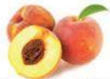
pits from cherries, apricots, and peaches