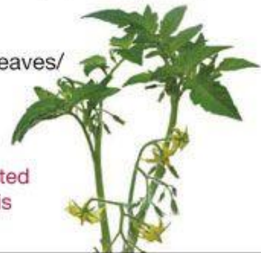
tomato leaves/ stems

*Although these foods can be tolerated (and enjoyed) by pets, everything is best in moderation.