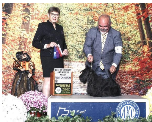
New Champion "Pepper" - CH PLAJ&K Keen Gaze at Afterglow