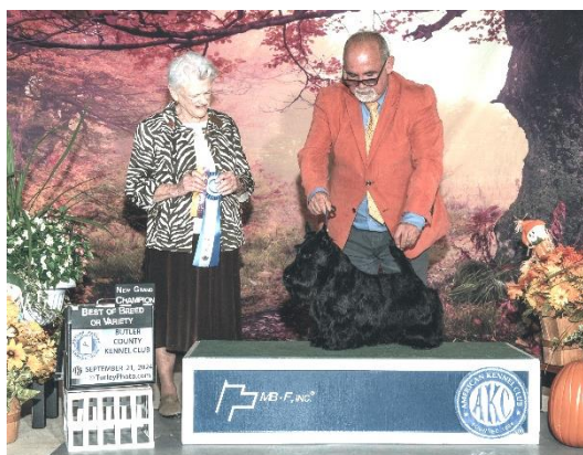
New Grand Champion "Edison" - GCH CH Hawkhaven Royal Salute at Afterglow