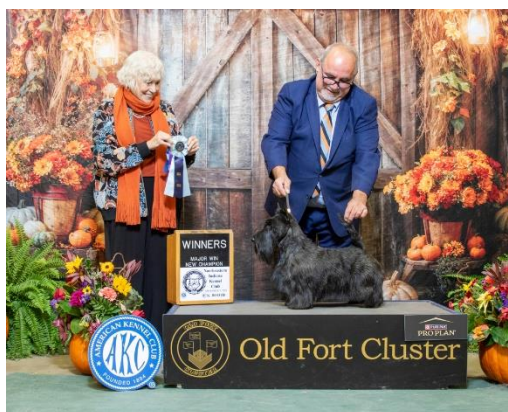
New Champion "Penny" - CH Afterglow's Penny's From Heaven