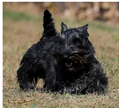
Ace – GCH CH Afterglow's An Ace Up The Sleeve BCAT