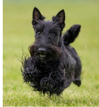
Beatrix – Afterglow's Little Crumpet of Hill Top BCAT