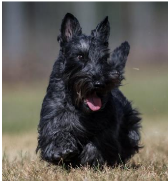
Nash – GCHS CH Afterglow's A Storms A Coming BCAT (Beatrix's sire)